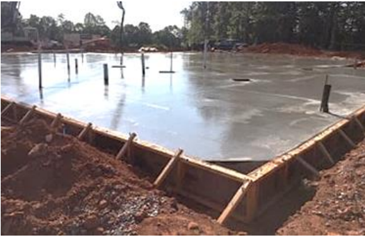
A major step forward as the slab for our new building is poured on March 22, 2019.