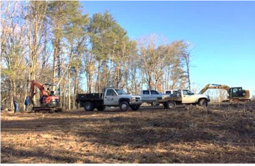
January 9, 2019 Nathan's Construction arrived on site and construction of the new building began.