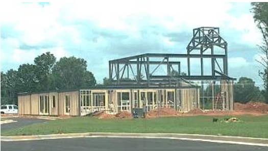
Steel began going up in June and by July the wood framing was rapidly making a huge difference in the appearance of our new building. Progress!