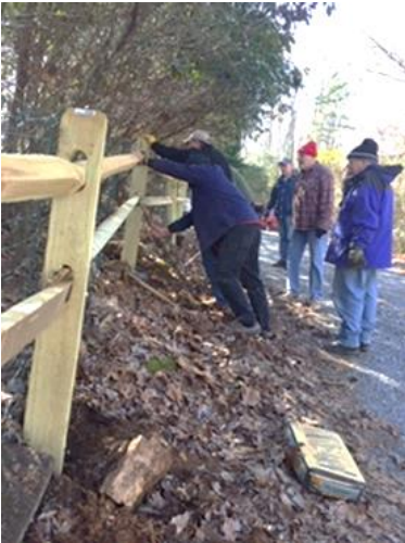
Faith, Hope, and Hammers replacing sections of fencing for one of our Faith members who received assistance with projects during 2019.

Our Faith, Hope, and Hammers program continues to be an important service for our church family. Volunteers cheerfully undertake small projects that might otherwise go undone--projects intended to improve quality of life--where we can lend a helping hand. This includes such things as minor electrical work/troubleshooting, minor plumbing repairs, computer technology services, church maintenance and painting, landscaping, etc., minor home and deck repairs, small painting jobs, moving the occasional (and relatively small) piece of furniture, hanging pictures. This year we have